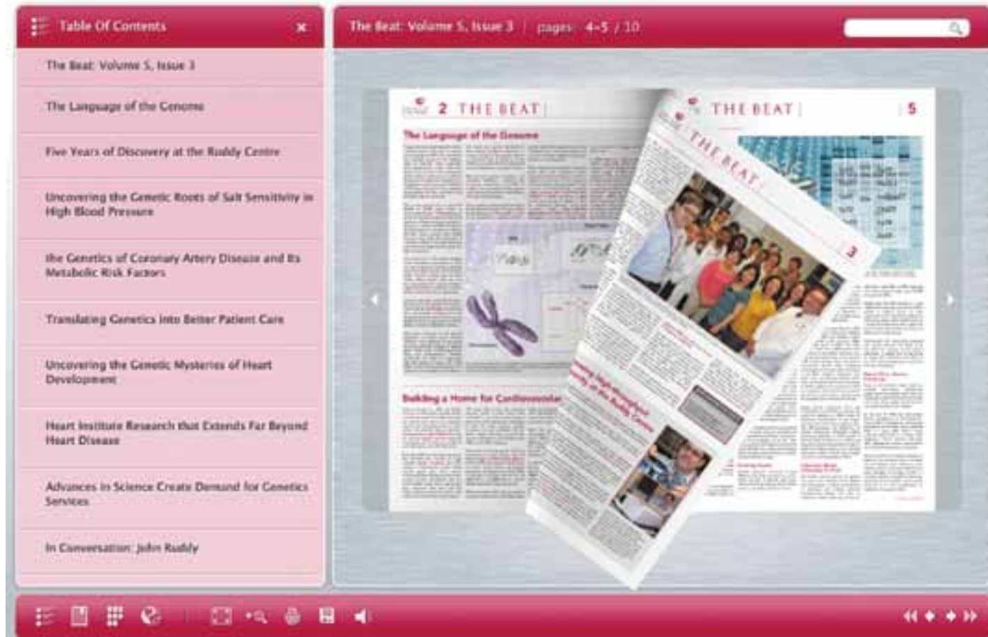
The new electronic edition of The Beat is fully interactive, with live links, an active table of contents and many other options to let you explore stories in greater depth.

At the same time, we do recognize the world is changing. To that end, we are pleased to be launching a new interactive edition of The Beat for our online readers. This issue of The Beat is the first to feature the new interactive edition. In technological terms, it is a major advancement over the PDF copies that were previously offered.