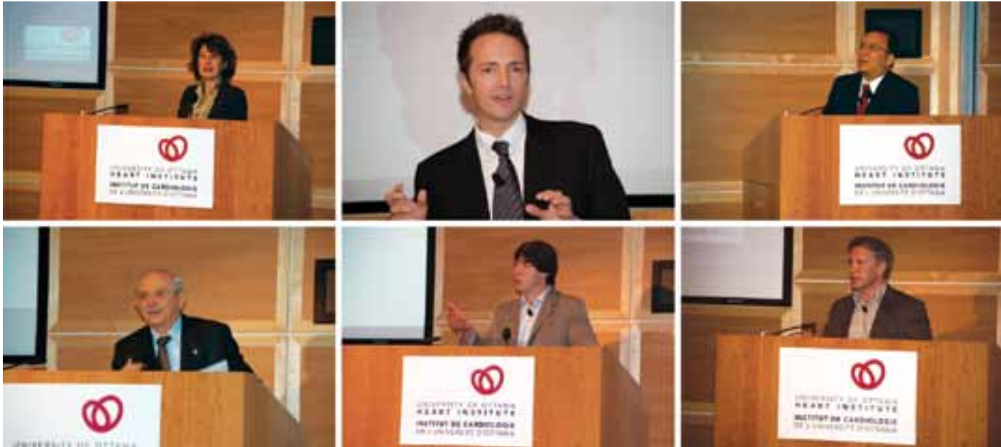
"The Endocrine Heart: 30 Years Later" brought together leading scientists in cardiovascular endocrinology from around the world to speak on the current state of knowledge and expected directions for new therapies.